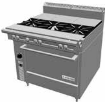
Model C386-15 Range with Three 12" French Tops