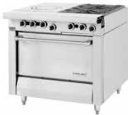
Model MST54R (valve control panel not as depicted) Range with Front-Fired Hot Top and Two Open Burners