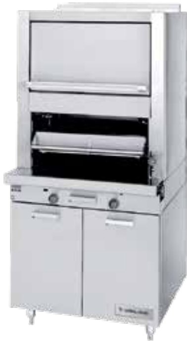
Model M60XS Ceramic Broiler with Upper Finishing oven