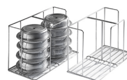
CP carries Covered Plates