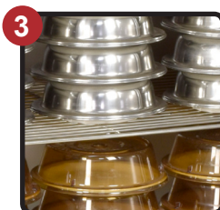
Heavy-Duty "No Sag" Shelves