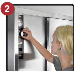
Eye Level Control Panel