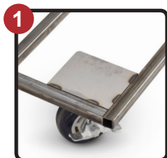
Tubular Welded Base Frame