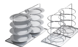
UP carries Uncovered Plates