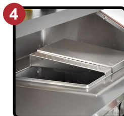
50lb Ice Bin with Drain