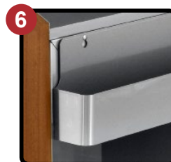
Removable Bottle Speed Rail