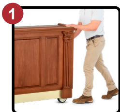
Made for Mobile Applications

BBC Bars are designed for bag-in-box beverage dispensing systems