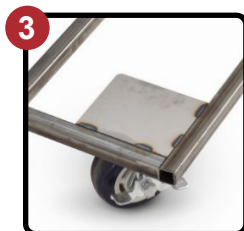
Tubular Welded Base Frame