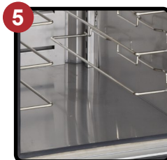
Open Bottom Base