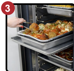
Adjustable No-Tip Tray Slides