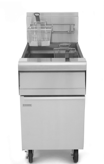
Shown with millivolt controller and optional casters