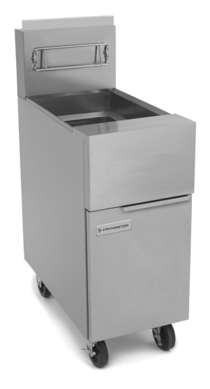
GF40 Shown with casters