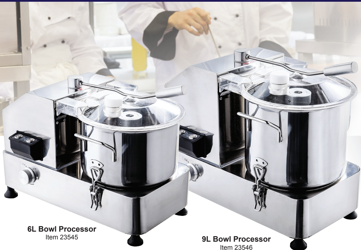
6L Bowl Processor Item 23545