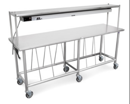
ET6-2484SSW WITH OPTION: X-FTR001