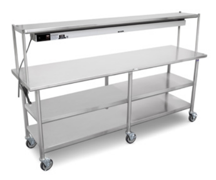
ET6-2484SSW WITH OPTION: X-FMS001