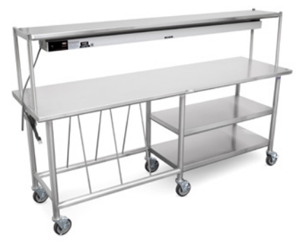
ET6-2484SSW WITH OPTIONS: X-HTR001 AND X-HMS001