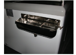
Optional dipper well