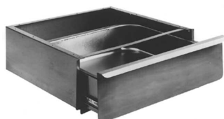
enclosed drawer assembly

* Holes are predrilled for 20" x 20" drawers only.