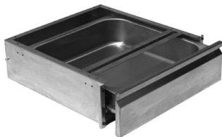
SPEC-MASTER® heavy duty drawer assembly