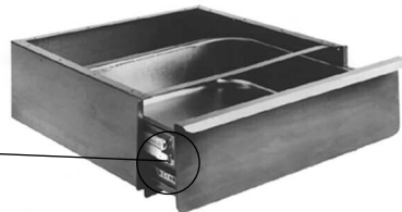
drawer assembly with NSF-approved slides