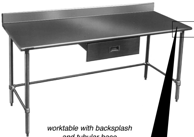
worktable with backslash and tubular base —shown with optional drawer

Blendport worktables, Deluxe series, model _____. Top constructed of 16 gauge 300 series stainless steel with 1½" roll on front, 4½" backslash, and sides turned down 90°. Open front with 1¼" O.D., stainless steel tubular crossbracing on sides and rear. Top reinforced with welded hat channels and sound deadened. Constructed with uni-lok® patented gusset system with the gussets recessed into the hat channels to reduce lateral movement. Legs are 1½" O.D., stainless steel tubing, with stainless steel gussets and 1" stainless steel adjustable bullet feet.