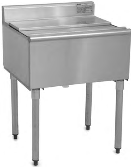
B2IC-22-7 ice chest

Eagle 2200 Series Ice Chests with Sealed-In Cold Plate, model _____. Top, front, backsplash and fabricated ice bin are heavy gauge type 304 stainless steel. Ice bin is fully insulated, with 1½" drain, and sealed-in 7-circuit cold plate. 1½" O.D. galvanized tubular legs with adjustable bullet feet.