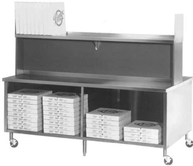
pizza cut-n-pack table

Eagle Pizza Cut-n-Pack Table, model _____. Heavy duty stainless steel construction with 16 gauge stainless steel top and open base storage. Plastic laminate divider panel with choice of colors, standard color is Formica 845 Spectrum Red. Mounted on casters.