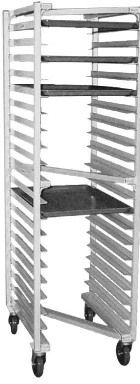
#OUR-1820-3-N "Z" type nesting rack