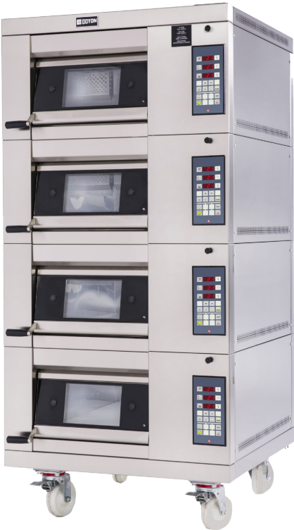
*SHOWN IN 1T4