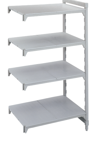
Stationary Starter Unit