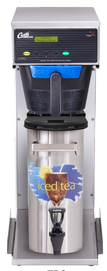
TBS Shown With TCN14 3.5 Gallon Dispenser (Dispenser Sold Separately)