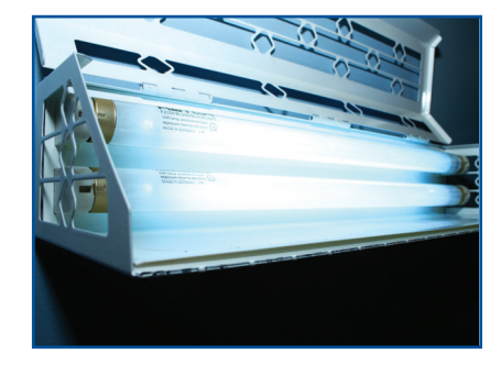
Two high-intensity UV bulbs attract flying insects over an 1800 sq./ft. area