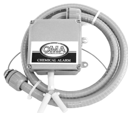
Low Chemical Alarm