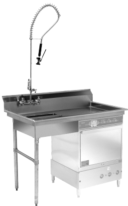
48" Undercounter dishtable with Pre-Rinse