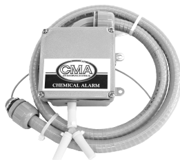
Low Chemical Alarm