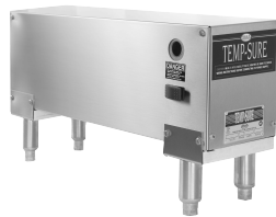
CMA Temp-Sure (Self contained 12kW heater)