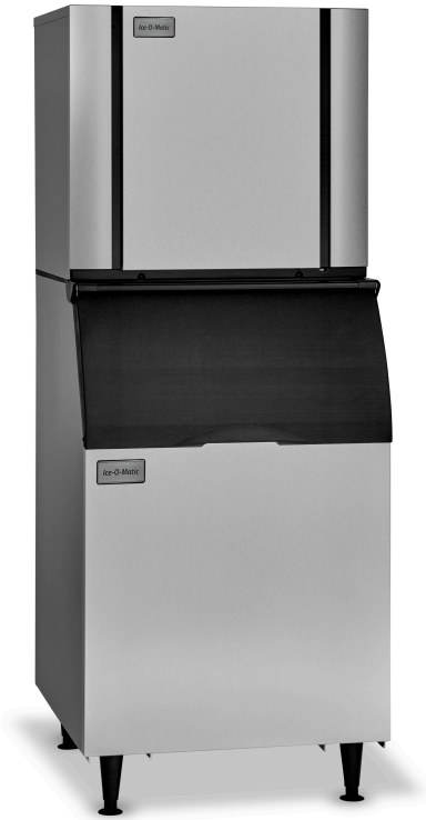
CIMO836 ON B55