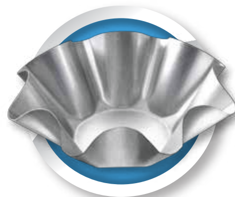
Tortilla Shell Pan Coated with AMERICOAT® Plus