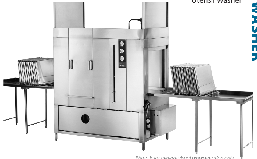
Photo is for general visual representation only. Please refer to specifications for the latest detailed product information.