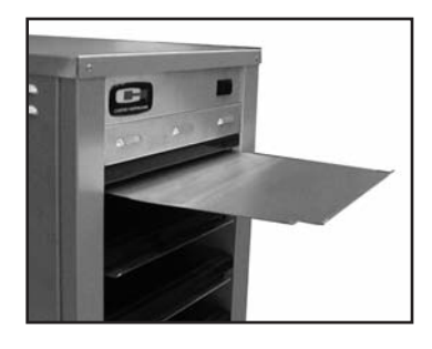
BUILT-IN LIDS... Covers seal in moisture and keep moisture-sensitive food fresh. Removable without tools for uncovered holding and easy cleaning.

STACKABILITY... Four-shelf and five-shelf units are field stackable, without the need for a stacking kit. Base of one unit (with casters removed) can nest inside the top of another unit (with top cover removed) using same fasteners and holes from cover.