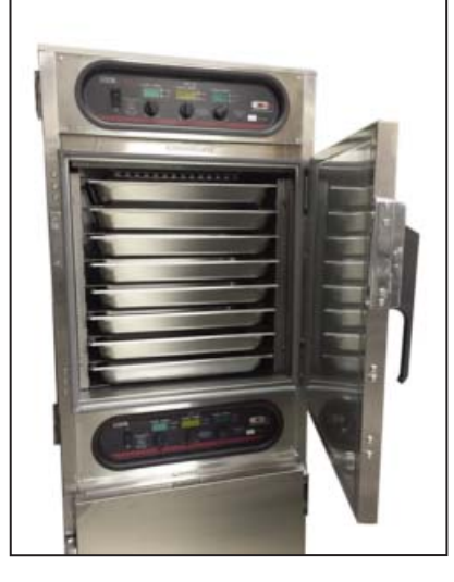
UNIVERSAL PAN SLIDES... Accommodates 12"x20"x2.5", GN 1/1 and GN 2/1 pans. Will accommodate 18"x26" sheet pans on optional wire shelves.

EASY-TO-USE DIGITAL CONTROLS ... Control cooking and holding with separate dial controls and digital display. Cook according to time or according to product temperature with meat probe. Temperature range of 100°F to 200°F for hold cycle and 100°F to 325°F for cook cycle. Eighteen hour timer counts down in cook cycle. When cook cycle is over, cabinet automatically switches to hold cycle and timer counts up. Displays in Farenheit or Celcius scale.