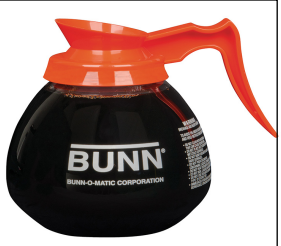
DECANTER, GLASS-ORN 12C 24/CS