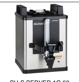
SH-S SERVER 1G 60 MIN ADJ TMR