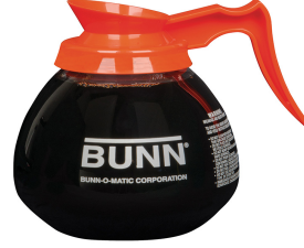
DECANTER, GLASS-ORN 12C 3/CS