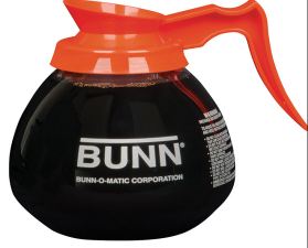
DECANTER, GLASS-ORN 12C 24/CS