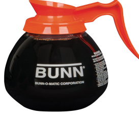
DECANTER, GLASS- ORN 12 CUP 1PK