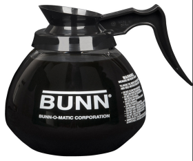
DECANTER, GLASS-BLK 12C 3/CS