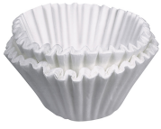
FILTERS,REGULAR1M 500/2 50/CL