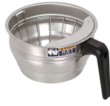
FUNNEL ASSY, SST-BLK HDL(7.12