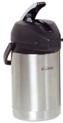
AIRPOT, 2.5L SST LA 6/ CASE