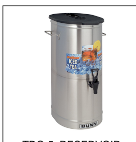
TDO-5, RESERVOIR, BREW THRU