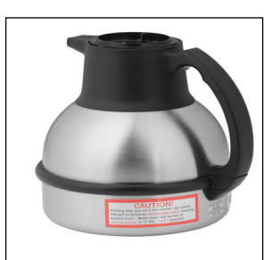
THERMAL CARAFE,ORN 1.9L 12PK