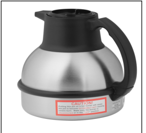
THERMAL CARAFE, BLK 1.9L 1PK