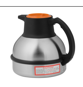
THERMAL CARAFE,ORN 1.9L 1PK