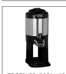
TF SERVER, DSG2 1.5G CD