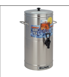
TDS-3, 3 GAL