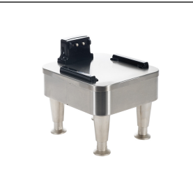
1SH STAND, 120V INF SERIES