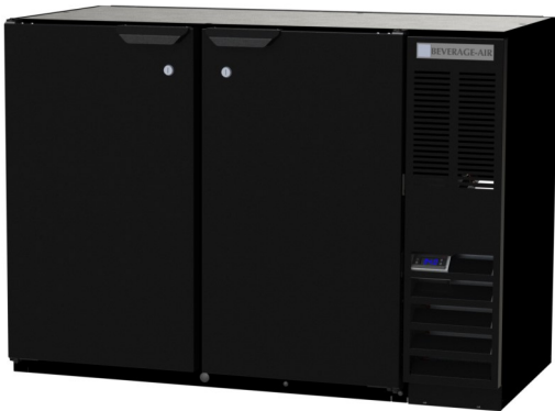
BB48HC-1-B (Black model shown)