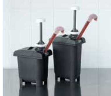
Topping Pumps are designed for use with 48 or 64 oz pouches with 16mm fitments or 7–10" fountain jars.