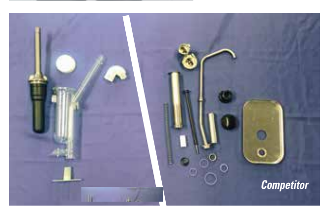
Cleaning and reassembly is easier and faster than ever! Nemco's Topping Pumps work flawlessly using less than a third of the parts found in alternative models on the market.