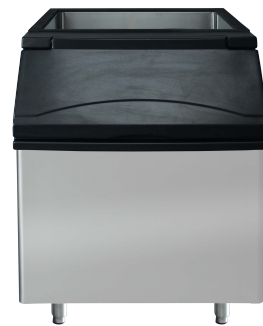
Optional bin #CYR700P