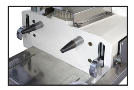
Interlocking Bowl Hooks And Dual Pin System Ensures Perfect Fit Between Bowl And Mixer Base

Ergonomic Handle Relieves Worker Fatigue