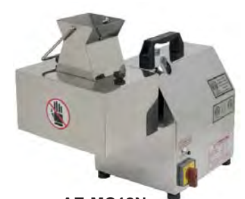
AE-MC12N 1HP MEAT CUTTER KIT