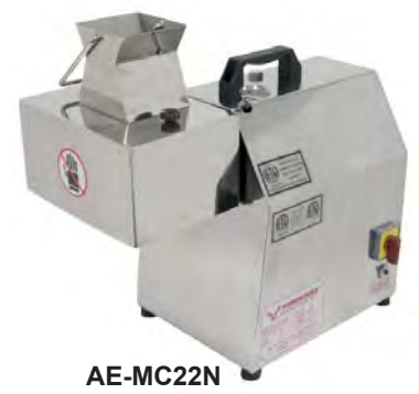
AE-MC22N ♥ 1.5HP MEAT CUTTER KIT