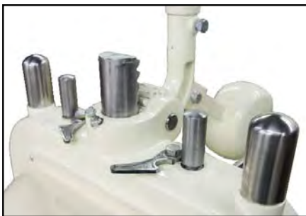
Extra Large Ram and Spindle Rods With Built-In Safety Locking Tabs