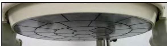
Precision Dividing Head And Stainless Steel Knives