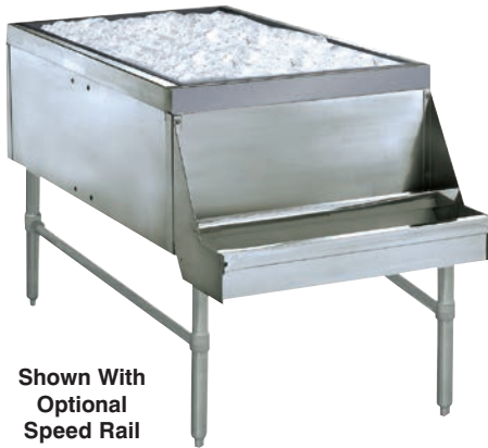
Shown With Optional Speed Rail