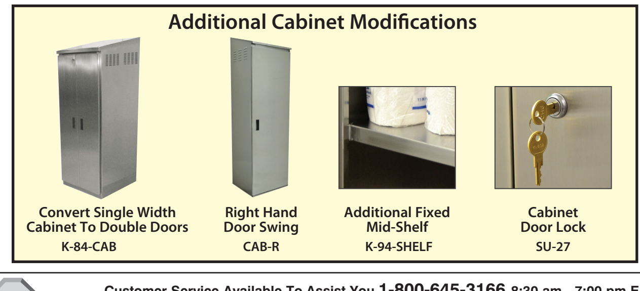
Standard Left-Hand Swing Door Shown *Optional Right-Hand Door Swing Available - See Below

Top 12" Fixed Shelf Allows Room For Mops and Broom Handles