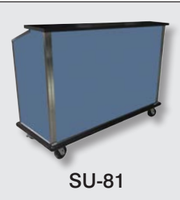
Custom Laminate Of Your Choice Consult Factory For Pricing & Details

Add Model Number At End Of Portable Bar Model Number When Ordering (Example: R-8-B-LCW)