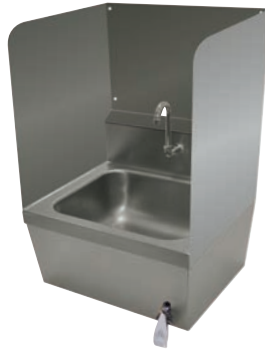
24" Side Splashes With Included Back Panel Shown Factory Installed Only

Bolt-on Side Splashes (field installation) require drilling holes in hand sink to match holes in side splash. Mounting hardware is not included.