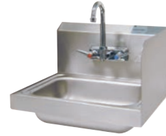
Single Sided 7-3/4" Side Splash Shown Factory Installed Only