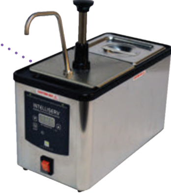
INTELLISERV<sup>™</sup> WARMER Model IS-1/3