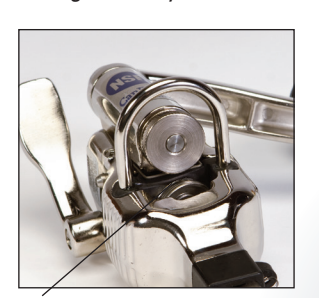
Tough, lasting, precision-ground stainless steel cutter—cuts up to 5,000 lids, and is easy to replace.

Replacement parts are available through Nemco's 24-hour Zip Program.