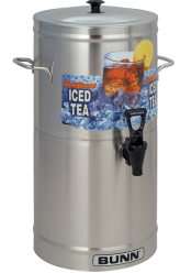
TDS-3, 3 GAL