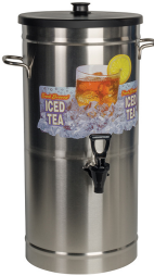
TDS-3.5, 3.5 GAL