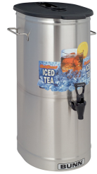
TDO-5, RESERVOIR, BREW THRU