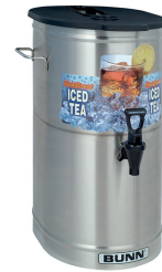
TDO-4, RESERVOIR BREW THRU